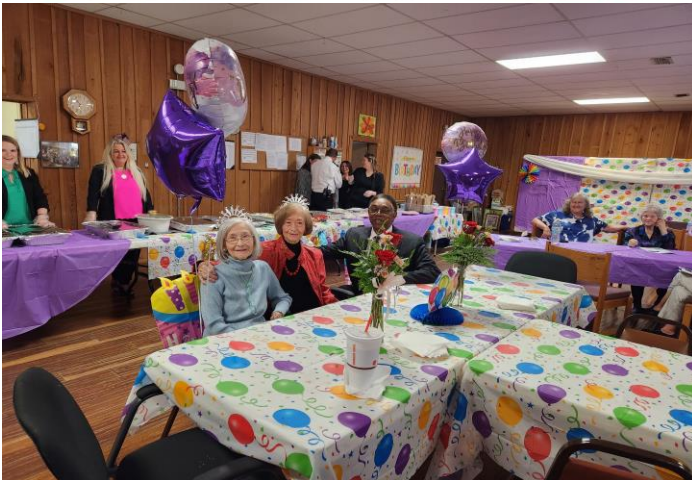
Last year Birthday Party 99 years old, a joyful day for the Ladies and the County! TW

Wewahitchka Historical Society, Inc https://wewahistory.org/